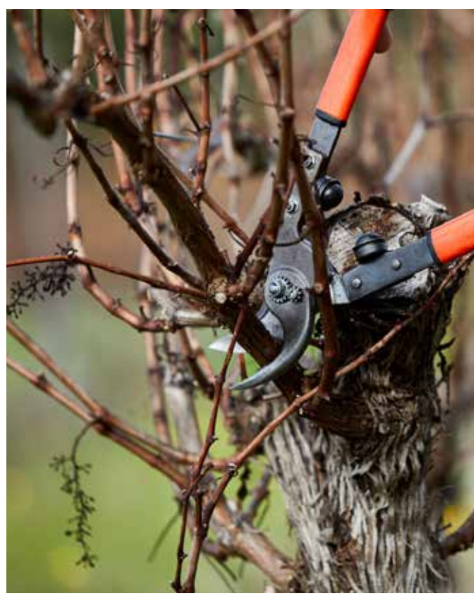
Left: Brown Hill's Reserve wines become increasingly popular as winter kicks in; right, winter time and colder temperatures in Margaret River means pruning time at Brown Hill to ensure a good crop next vintage.