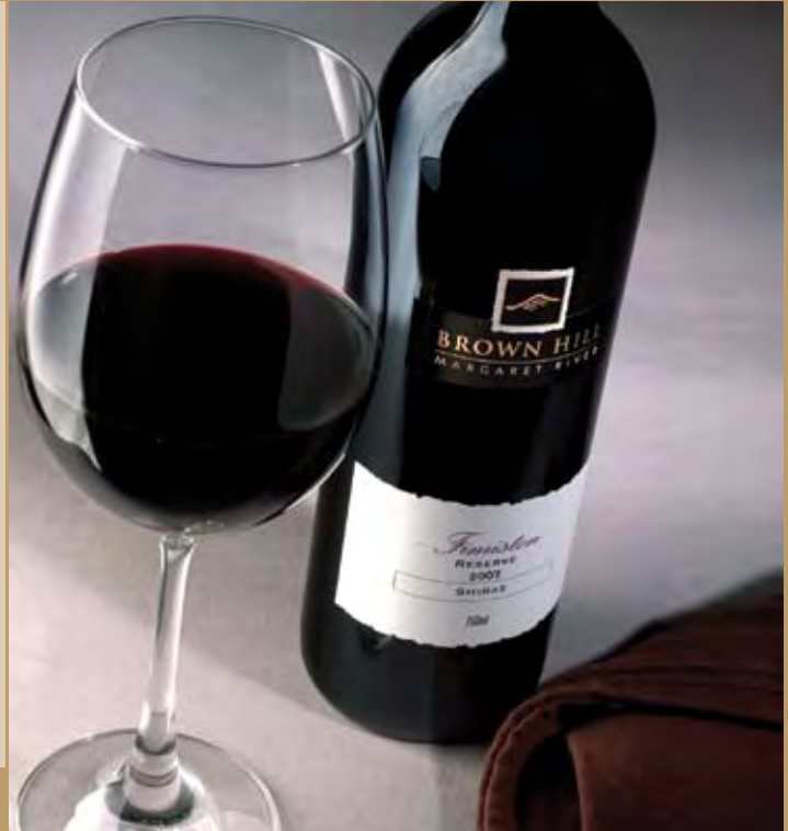
Pictured Right : Heart-warming red - new-release Fimiston Reserve Shiraz 2007.

Remember, buying directly from us not only gives you a taste of absolute Margaret River quality, but also our iron clad quality guarantee and FREE delivery anywhere in Australia. I hope you get great enjoyment from our wines, particularly at this time of year with our tempting range of great value, heart-warming reds – perfectly suited to sipping with rich, hearty slow-cooked winter fare. Cheers!