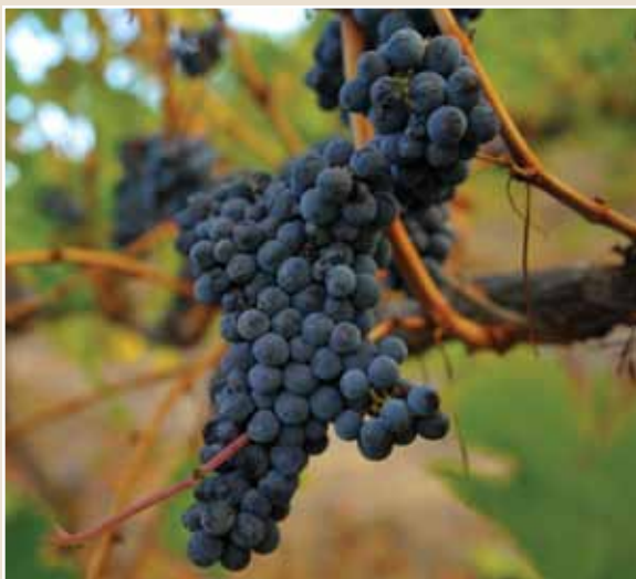
The quality of fruit from the 2011 harvest looks good.

With all the indulgence of summer and the festive season behind us, it's a good time to think about taking stock and replenishing. So take your time to browse through the newsletter and pick the perfect combination of wines to fill your wine rack or cellar. We deliver dozens free everywhere in Australia so no matter where you live, the finest estate-grown, handcrafted Margaret River wines can be at your door within days.