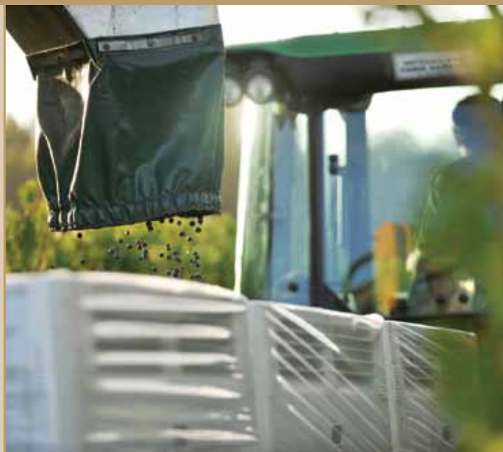
Picking the grapes for our 2010 vintage, another fantastic season.

The 'Mixed dozen price' includes straight or mixed dozens – pick any combination of wines to create your own mixes according to your tastes. If you're not sure what to choose, we're happy to help.