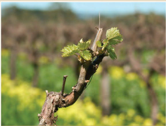
The first green shoots of the season sprouting at Brown Hill.