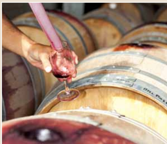
Sampling the Bill Bailey prior to bottling.

And remember: purchase a dozen or more of our estate grown, Margaret River wines and we'll delivery anywhere in Australian, absolutely FREE.